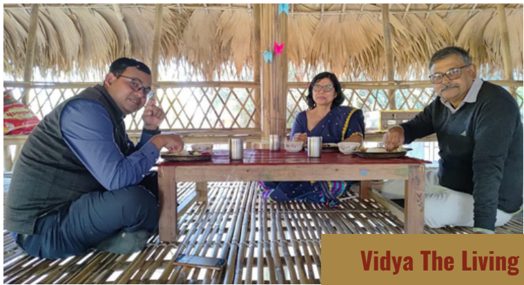
Vidya The Living School, Dhemaji